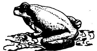
Pine Barrens Treefrog

The cost for this program is only $5 per person. You must provide your own transportation. Long pants and boots are recommended, bring insect repellent. Persons who are interested in attending should complete and return the registration form in this newsletter or call (609) 971-1635 for more information.