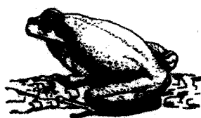
Pine Barrens Treefrog

The cost for this program is only $5 per person. You must provide your own transportation. Long pants and boots are recommended. Bring insect repellent and a flashlight. Persons who are interested in attending should complete and return the registration form in this newsletter or call (609) 971-1635 for more information.