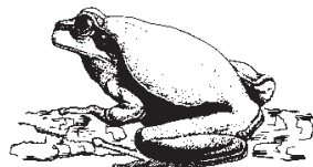
Pine Barrens Treefrog

The cost for this program is only $5 per person. You must provide your own transportation. Long pants and boots are recommended. Bring insect repellent and a flashlight. Persons who are interested in attending should complete and return the registration form in this newsletter or call (609) 971-1635 for more information.