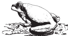
Pine Barrens Treefrog

The cost for this program is only $5 per person. You must provide your own transportation. Long pants and boots are recommended. Bring insect repellent and a flashlight. Persons who are interested in attending should complete and return the registration form in this newsletter or call (609) 971-1635 for more information.