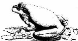
Pine Barrens Treefrog

If you would like to try your luck at discovering an endangered Pine Barrens Treefrog join us on the evening of Friday, June 4 2010. We will meet at the former Bamber Store at 7:30